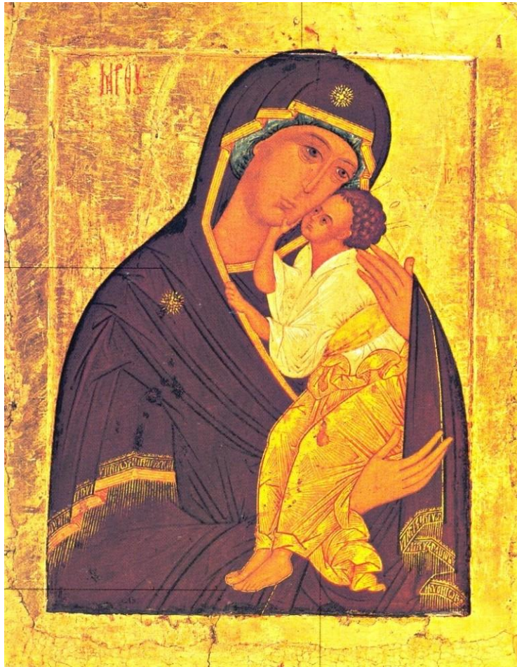
Anonymous, Mother of God of Jaroslavl , second half of the 15 th century, tempered on panel, Moscow, Trät'jakov Gallery

This icon belongs to the collection of Our Lady of Tenderness, evidenced by the faces of the mother and child and the mutual concern between the two.