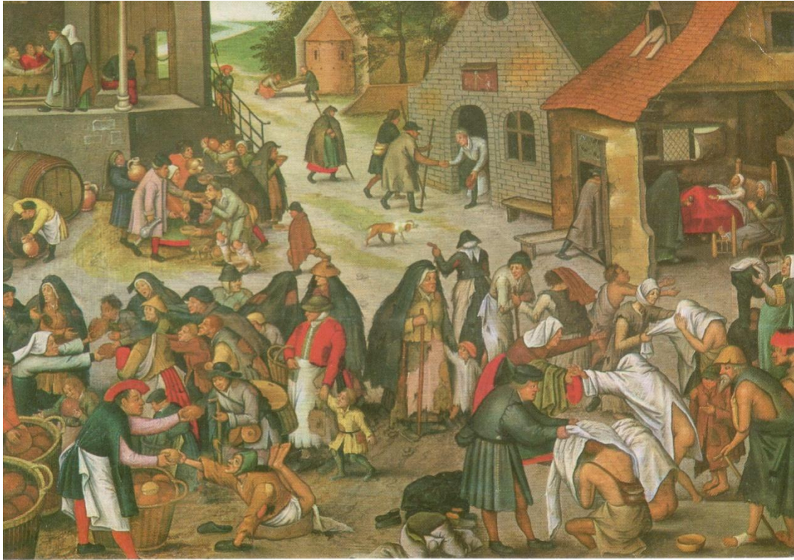
Pieter Brueghel the Younger (Brussels, 1564 – Antwerp, 1638), The works of mercy , around 1630, oil on oak wood, 41.5x56 cm, Lisbon, National Museum of Ancient Art

What strikes about this small painting by the Flemish painter is the lack of a main character.