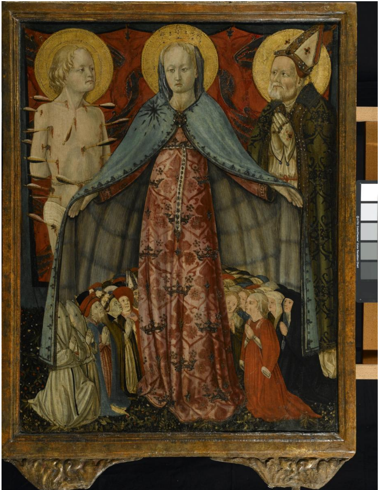
Antonio da Fabriano (active between 1451 and 1489), Virgin of Mercy , approximately 1470, oil on wood, 97x75 cm, Milan, Istituto Giuseppe Toniolo di studi superiori