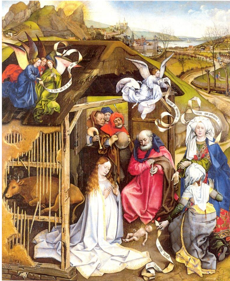
Robert Campin, known as the Artist of Flémalle (1378/79 – Tournai 1444), Nativity , around 1430, oil on wood, 86x72 cm, Dijon, Musée des Beaux-Arts (museum of fine arts)

This nice scene of the Flemish master presents three different episodes linked to the birth of Jesus coming from two different traditions: under a ruined building, a shed where we see an ox and a donkey, there is Mary, dressed in white and with loose hair, who loves the young Jesus, laid on the dirt floor, while Joseph is on the side holding a small candle in his hand. Behind them, looking out of a window of the shed, three shepherds have arrived, who look at the child almost with fear; despite being in the background, their presence is important, as testified by the fact that they are represented exactly at the point where the two diagonals cut the painting. Both these episodes are narrated at the beginning of the second chapter of the Gospel of Luke (vv. 1-20).