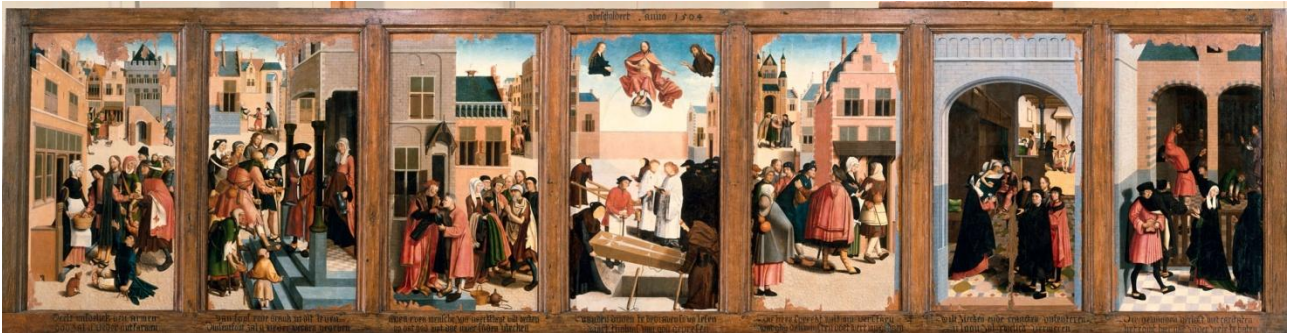
Master of Alkmaar (active in Utrecht and Alkmaar between 1490 and 1510), Works of Mercy , 1504, oil on panel, 118x470cm, Amsterdam, Rijksmuseum.

This artwork was ordered by the regents of the brotherhood of the Holy Spirit in Alkmaar (who may be the three characters at the forefront on the right, in the scene Heal the sick ) for Saint-Laurent church. In the centre of the upper frame, we can see the date of execution (1504) and in the lower frame of each scene, there are scriptures reminding the faithful that they will receive great rewards in the world to come if they help others with the work of mercy.