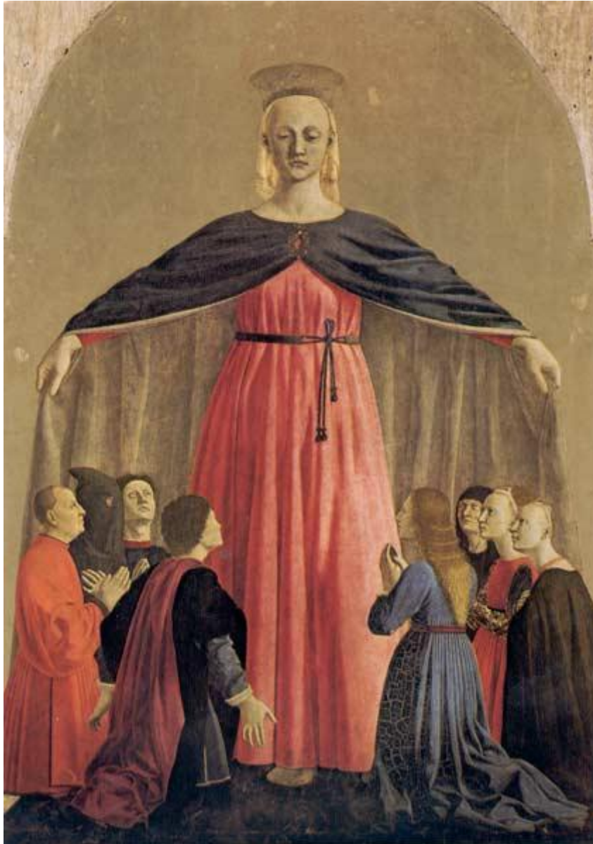
Piero della Francesca (Borgo Sansepolcro 1416/17 – 1492), Our Lady of Mercy , 1445-1462, oil and tempera on wood, cm 168x91, Sansepolcro, Museo Civico

The table is in the middle of a great altarpiece, that is made up of five large panels, a dais and eleven boards distributed across the molding and sides, Piero was asked by the Brothers of Mercy in 1445 to adorn the main altar of the church next to the Hospital. The piece, due to various other commitments taken on throughout Italy, was finished 15 years later.